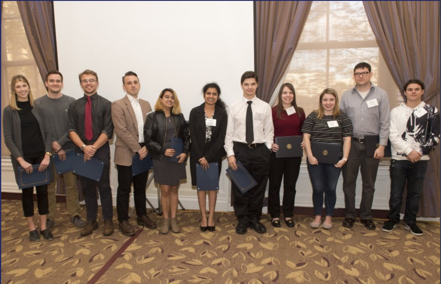
2017 Games4Health Winners at the 3rd Integrative Conference on Technology, Social Media, and Behavioral Health .